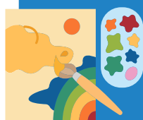
Illustration is another creative career that you may wish to consider. Here is free library of illustration resources to help you on your way to monetizing your skills.

Are you considering a career in publishing? The Society of Young Publishers are pleased to present Inside Publishing, the podcast series interviewing industry experts on everything publishing. You can listen here .