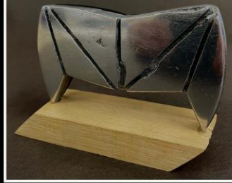
10/Tr Trophy project 2021-2022