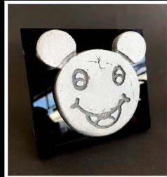
10/Tm Trophy project 2021-2022