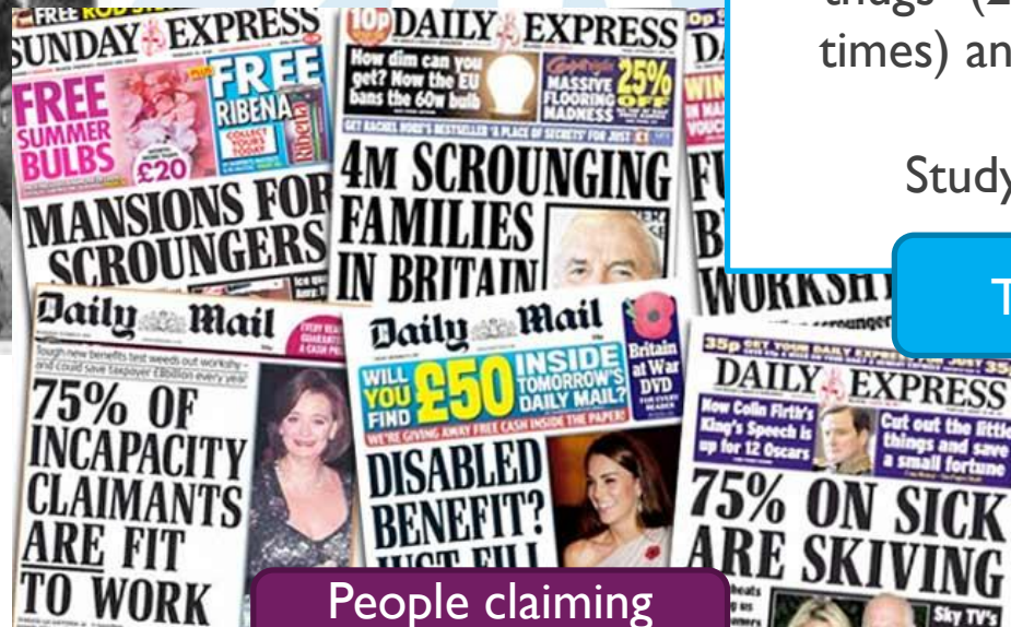
People claiming benefits

“Figures show more than half of the stories about teenage boys in national and regional newspapers in the past year (4,374 out of 8,629) were about crime. The word most commonly used to describe them was "yobs" (591 times), followed by "thugs" (254 times), "sick" (119 times) and "feral" (96 times).”