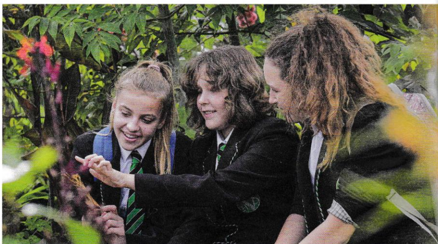
The RHS Green Plan It initiative encourages secondary-school students to learn about the importance of plants and green spaces.

So that these students' creativity and hard work has a longer-lasting legacy, we encourage schools to go one stage further and create the gardens they designed.